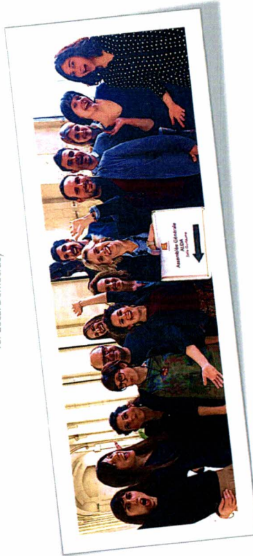
Promoting good governance and citizen participation at the local level in the enlarged Europe since 1999